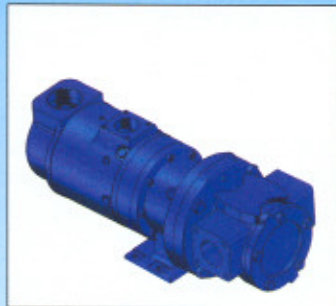
T30-M & Integral 30GPM Oil Pump