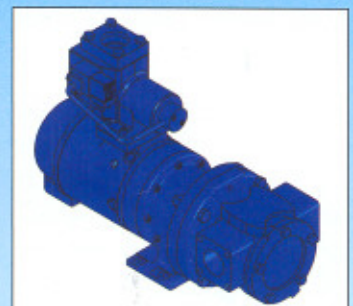
T30-M Motor, Oil Pump TurboValve & Solenoid