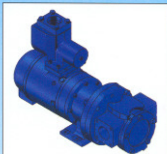
T30-M Motor, Oil Pump Integral TurboValve